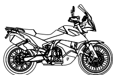
KTM 790 ADVENTURE