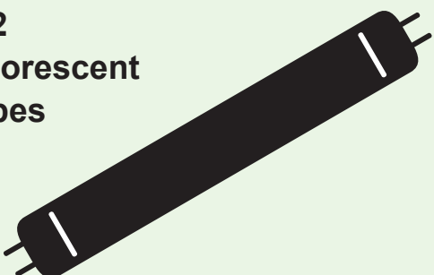
T12 Fluorescent Tubes

For Commercial Properties using 100 fixtures with 2 tubes per fixture: