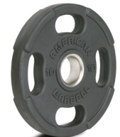
PICTURED: 10 LBS