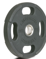
PICTURED: 25 LBS