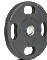
PICTURED: 35 LBS