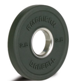
PICTURED: 2.5 LBS