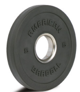
PICTURED: 5 LBS