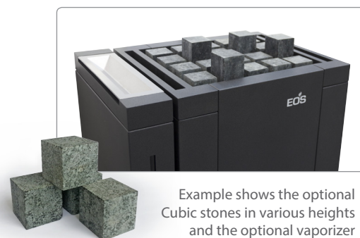
Example shows the optional Cubic stones in various heights and the optional vaporizer