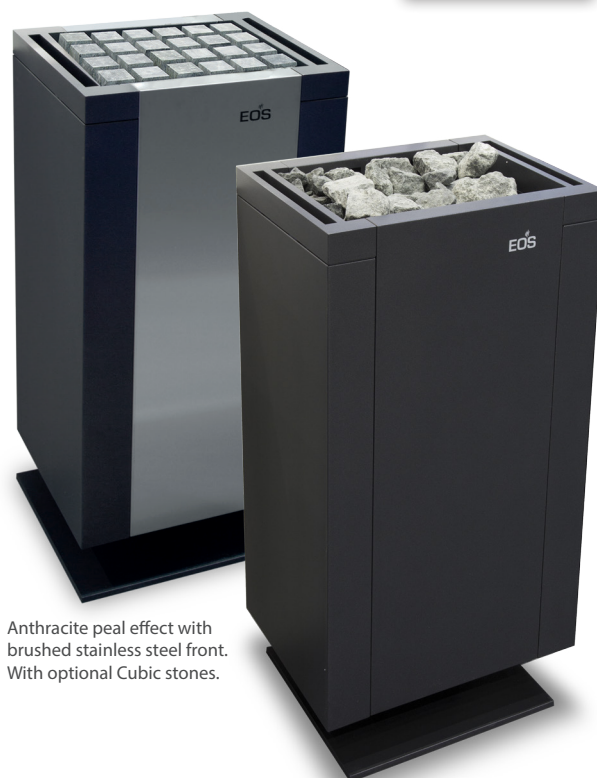
Anthracite pearl effect with brushed stainless steel front. With optional Cubic stones.