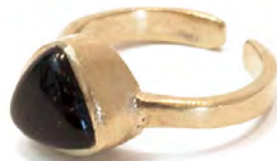
erin midi ring

triangle stone set in a solid brass adjustable ring. options - black onyx + rutilated quartz