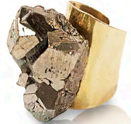
blake cuff ring

large natural pyrite stone set on a solid brass adjustable cuff ring.