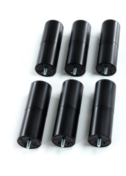
OP051 Screw-In Feet x6