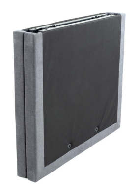
OP050 Motion Base