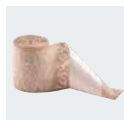
Plain silicone topband rose (FBR)

medi tip: barely noticeable, fine micro-dots on the reverse, for a reliable grip. Very good air circulation. Neutral design. Fine, thin topband quality.