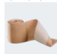
Silicone micro dot topband sensitive (MBs)