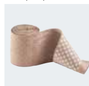
Silicone dot topband motif (NoM)