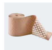
Silicone dot topband (NoB)