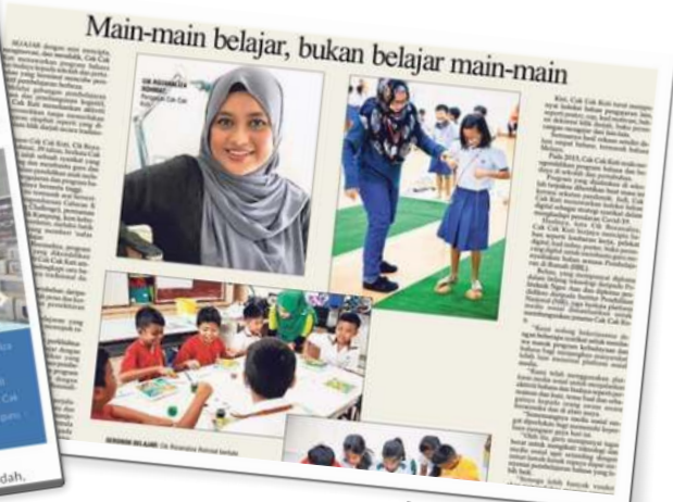
Berita Harian, Singapore March 14, 2022