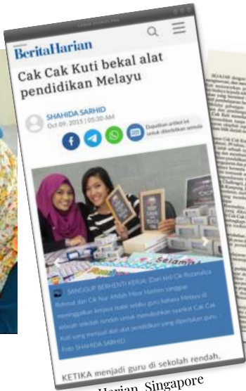
Berita Harian, Singapore October 9, 2015