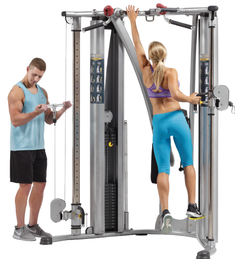
BICEPS CURL & PULL-UP

*TRX Strap and Medicine Balls not included. TRX is a registered trademark of Fitness Anywhere LLC (TRX).