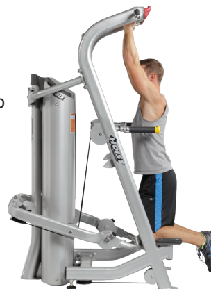
CHIN UP (ASSISTED)