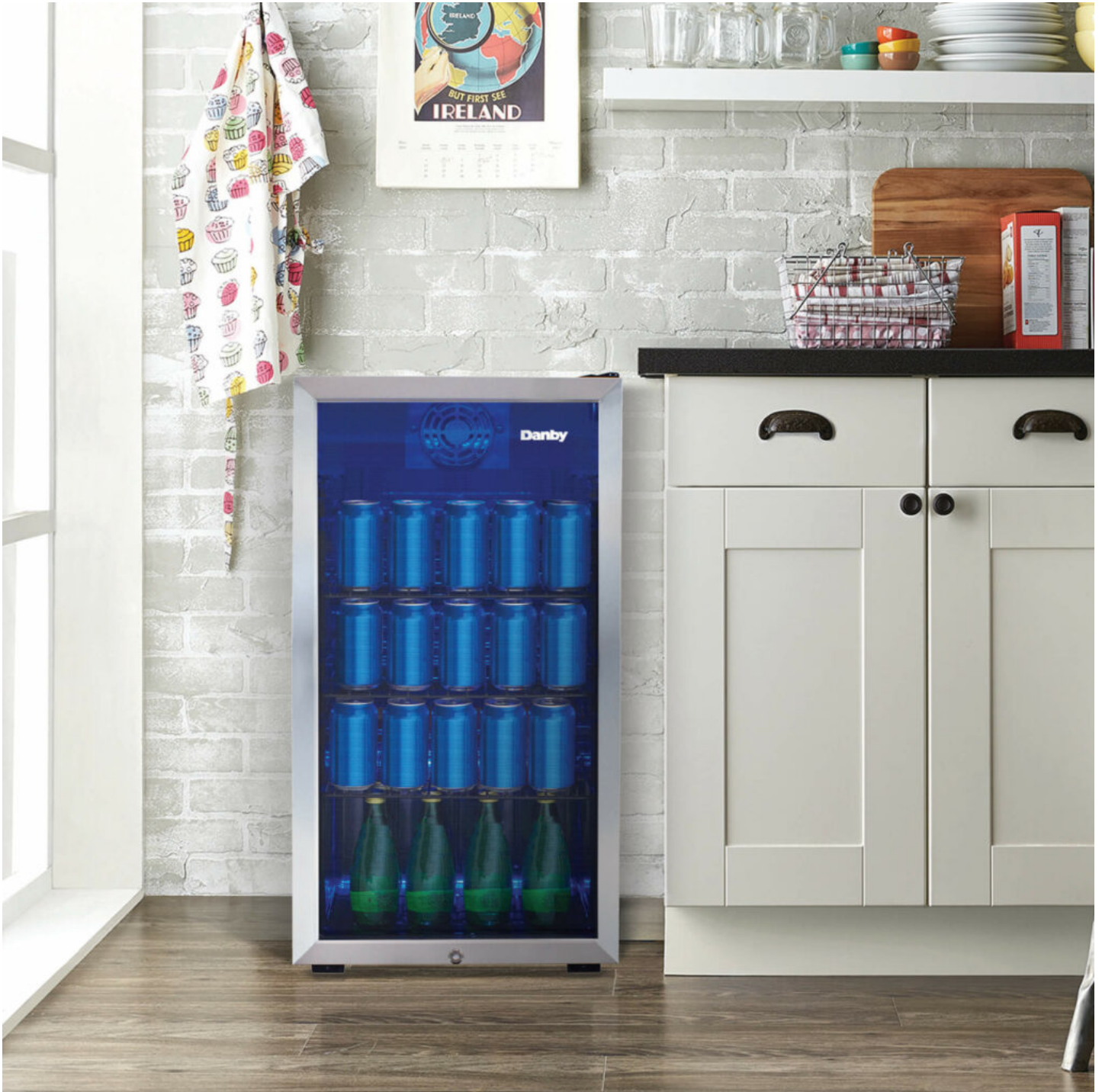
117 (355ml) Can Capacity