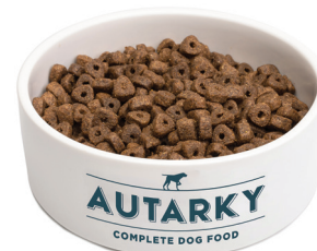
Avg Weight per 100ml: 55g

Always ensure that clean, fresh drinking water is available at all times. Do not be tempted to feed excessive amounts of titbits or treats.