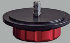
38 - 52mm HALF COUPLER CLAMP SET SKU: GFC48500-S - 2 Pieces