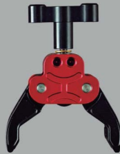
UNIVERSAL CLAMP SKU: GFUC - 2 Pieces