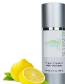
Triple Peptide Anti-Wrinkle Serum $49.99