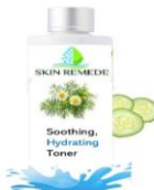
Soothing Hydrating Toner $29.99