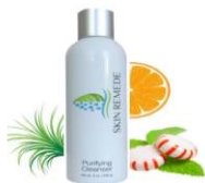
Purifying Cleanser $38.99