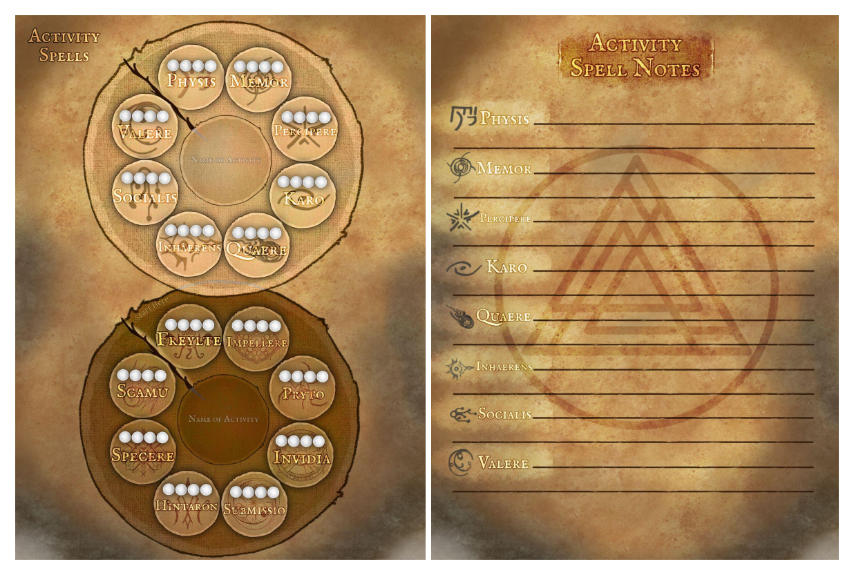
Spell Circle Front