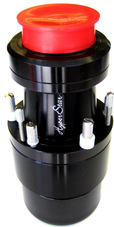
Holder capping the HyperStar