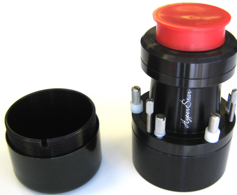
Holder removed to accept secondary mirror