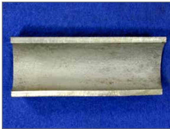
New Steel FPS Pipe Treated with MICtreat® FPS Chemical