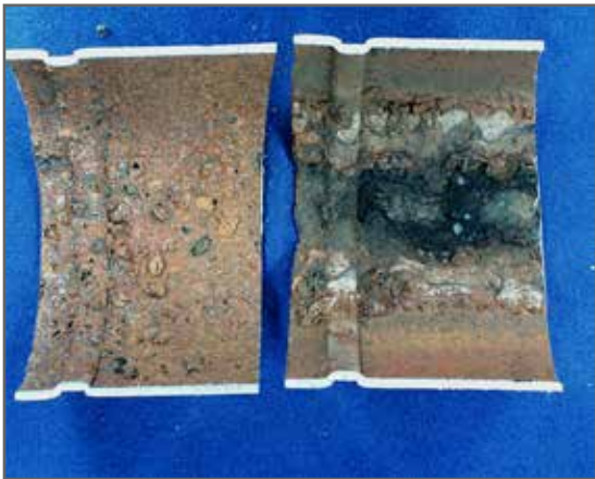
Untreated Steel FPS Pipe

THPS, the active ingredient in MICtreat® FPS Chemical, disrupts bacterial cells and inhibits enzymes and energy production in microbes, including those causing MIC. THPS also reacts with oxygen (forming a non-toxic oxide), thus reducing an important nutrient for MIC-related bacteria and a very important reactant in many severe corrosion reactions. Results of treating steel FPS pipes with MICtreat® FPS Chemical are shown in the following pictures and table.