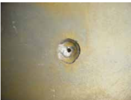
Figure 4. Pinhole leak in dry galvanized FPS pipe. This pitting occurred under discrete deposits located where water puddles had been.

formation of discrete deposits (a.k.a. tubercles or carbuncles; see Figure 2)