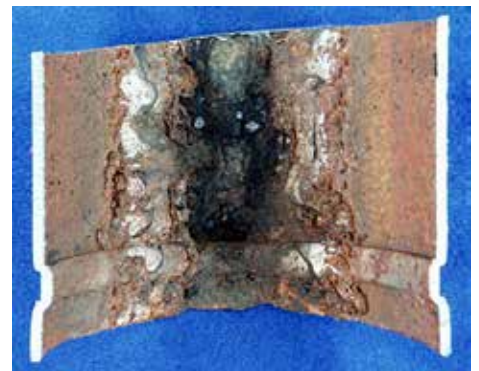
Figure 6. Pipe from dry FPS showing an air-water interface where a puddle had been. Note the discrete deposits and severe under-deposit pitting in this area.