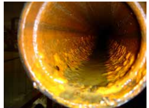
Figure 5. Larger diameter wet FPS pipe showing an air-water interface because of an air pocket. Water, oxygen, microbes, and sediments were concentrated along the bottom of the pipe. The result is MIC, as evidenced by the discrete deposits seen here and localized pitting under the deposits.

Usually, only small portions of the FPS where MIC factors are present —due to the way the FPS is constructed and operated—suffer severe MIC