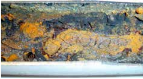
Figure 2. Discrete deposits on interior of steel pipe. These deposits are formed by microbes depositing materials from water and by the accumulation of corrosion products.