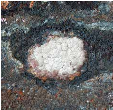
Figure 3. Under-deposit pitting corrosion showing distinct pits-within-pits, which are characteristic of MIC. This type pitting can occur at 0.200” per year and can penetrate FPS pipes within a few months after installation.