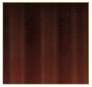
Ridgeback Corrugated (available for single-sided models only)