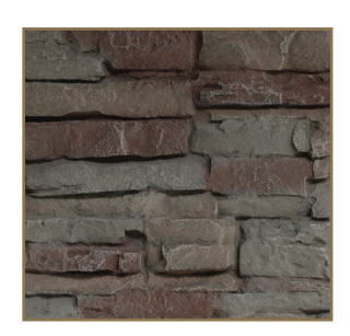
Ledgestone (available for see-through model only)