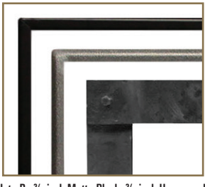
L to R: ¾-inch Matte Black; ¾-inch Hammered Pewter; 3-inch Forged Iron