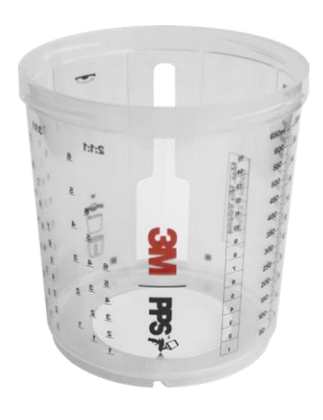
CA91-565-P mL 3M PPS gravity hard cup