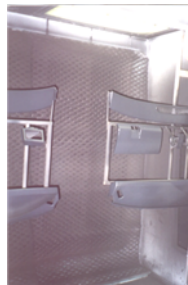
Eliminate Sagging Filters

No wrap-around at side walls, ceiling or floor and no overlap means less un-used (wasted) filter media.