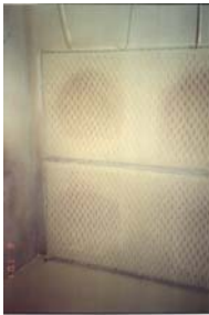
Prevents overspray bypass around filters

Make the move to Paint Pockets Zipper Mounting system and get that help!!