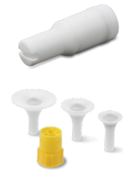
PEM-X1 Spray Nozzles