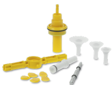
Spare parts starter package