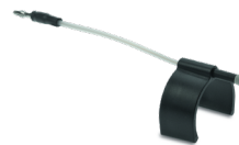
CoronaStar for PEM-X1