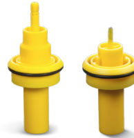
Electrode holder for X1