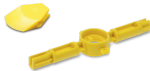
Wedge tool & wedges