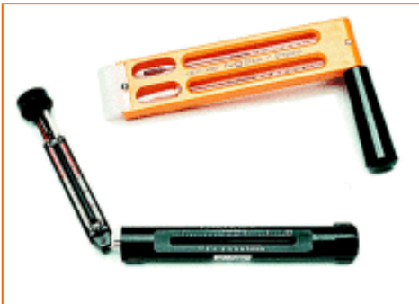
Elcometer 116 Whirling & Sling Hygrometer