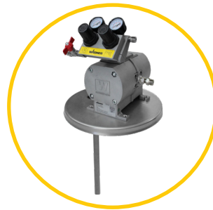
5 Gallon Pail Mount