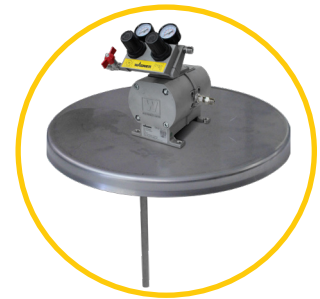
55 Gallon Drum Mount