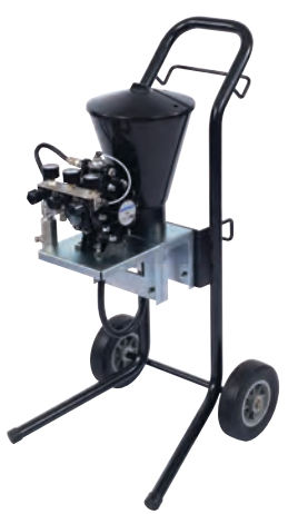
DX70R3-CFG Cart mounted pump with 1.4 gal (6L) gravity bucket feed filter and three air controls