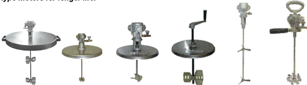
55 Gallon Drum Agitator with SS cover P/N 54-450

The TechLine economy mixers are for the professional wanting a good mixer at a great price. All of these units have stainless steel shafts. The 54-400, 54-410 and 54-450 units have plastic blades, all other models have stainless steel blades. The air motors are piston type motors for longer life.