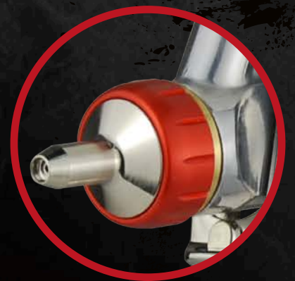
R5 Aircap Maximum precision