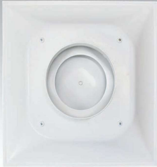
Back side of cone diffuser