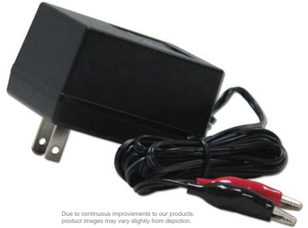
Due to continuous improvements to our products, product images may vary slightly from depiction.