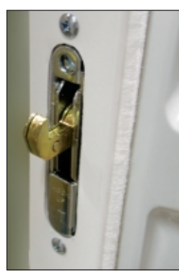
Single Hook-Style Door Lock