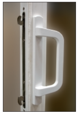
Double Hook Reverse-Style Door Lock

...then place Two Lock Catches like this.