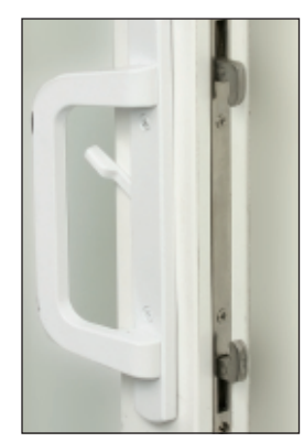
Double Hook-Style Door Lock

...then place Two Lock Catches like this.