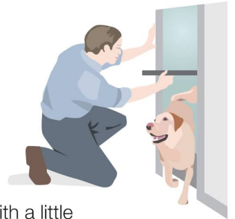
Figure out which pet door flap size to choose