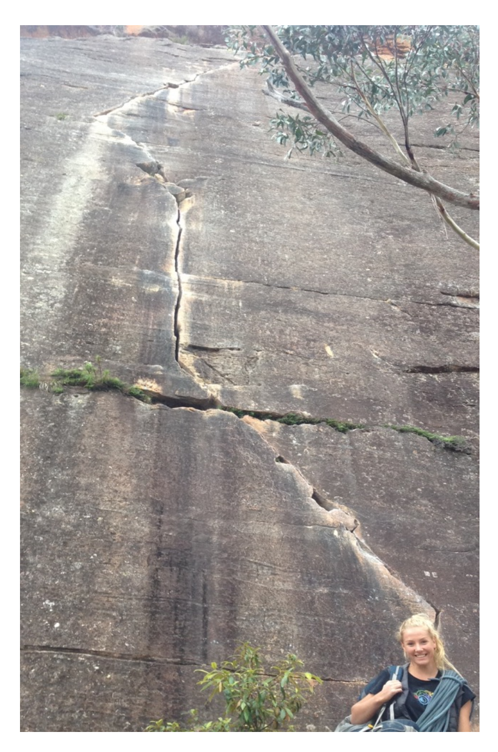
Me at the base of Eternity Crack (18) at Mt Piddington, probably my favorite climb of the trip.

My first time in the Blue Mountains was completely different to Mt Arapiles with its striking orange sandstone towering over the evergreen, ageless pines; but it was just as excellent. In two weeks we saw enough of the mountains to make us want to return quickly to its superb climbing, vast canyons and forests, unclimbed classics, beers around the fire, the best lattes ever made and of course, some truly wonderful people.