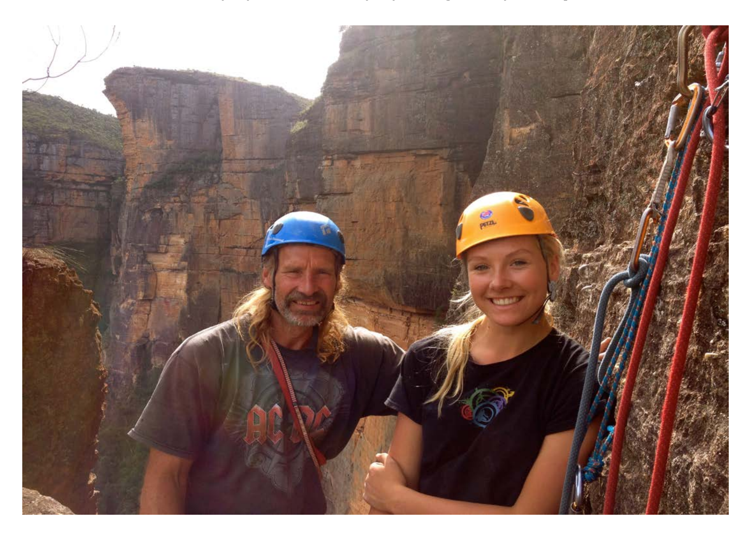
Dad and I on the West Face of the Mirrorball (21).

A day was planned to venture to Pierces Pass and summit the West Face of the Mirror Ball: a 120 metre, slightly run out, four pitch route graded at 21. Brad, Dad and I each took our turn at leading a pitch of the route; placing and recollecting carrot bolts as we went. Sport climbing is well entrenched as the Bluey's most popular climbing and big cliffs such as this are not left unscarred, however, I must admit that I was glad to be clipping a bolt as I dragged myself over the crux and onto the ledge, being likened to a beached whale by my father. I can only say that I got all my technique from him.