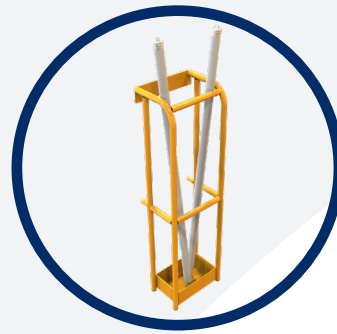
Strip Light Bulb Holder

Keep tools safe and secure whilst working at height