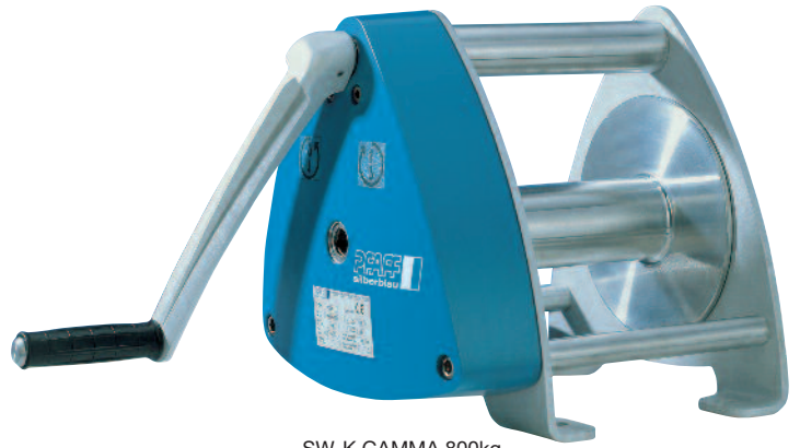
SW-K GAMMA 800kg