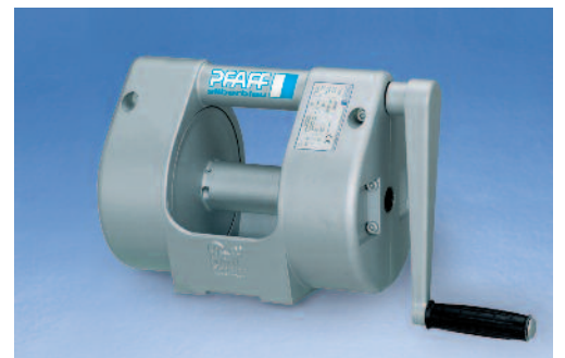
SW-K GAMMA - 500kg

*Recommended wire rope DIN 3060 FE-znK-1770 sZ spa. **Low/high-speed. • All Pfaff winches are supplied WITHOUT wire rope.