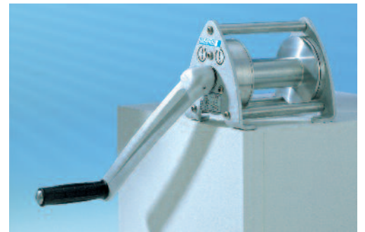
SW-K GAMMA - 200kg