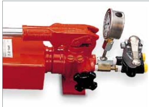
Hand pump model: HPH...

Appropriate pressure gauges with the corresponding adaptors are shown.