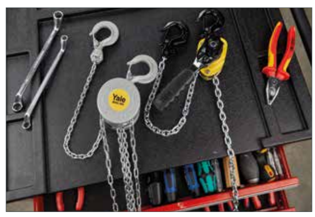
Fits in every tool box