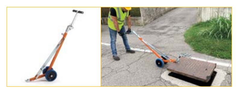
To be used with both APS90 or APS80