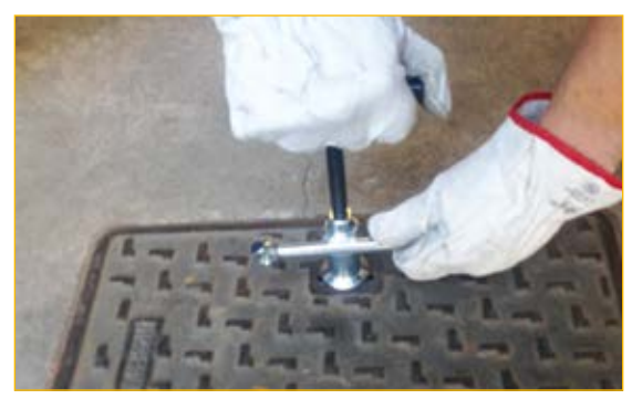
Phase 1 : set the hook central bar in the position that can be hooked up by the APS90/APS80.