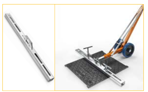
Use with two clamps in combination with the lifting transversal BAR \ensuremath{\mathbf{BT95}}.