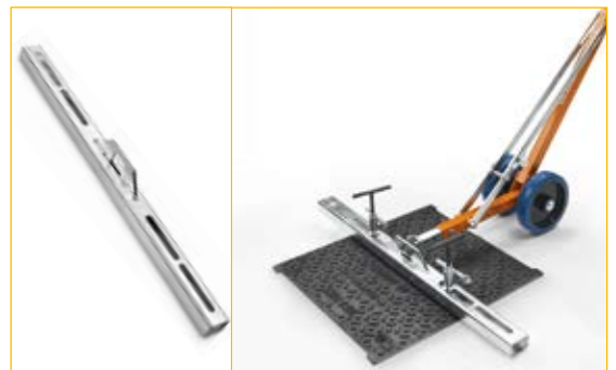
Use with two clamps in combination with the lifting transversal BAR BT95 .