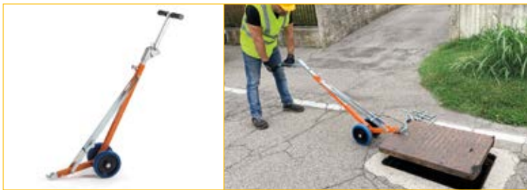
To be used with both APS90 or APS80