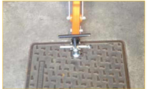
Phase 2: engagement of the lever in the clamp.