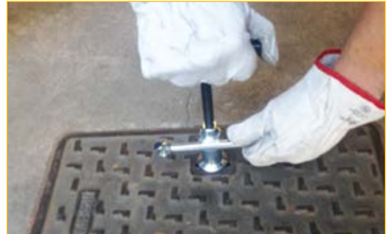
Phase 1: set the hook central bar in the position that can be hooked up by the APS90/APS80.