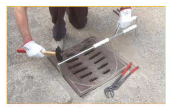
The beaks can also be used in the operations of scraping the frame of the lid.

Ideal for opening and repositioning manhole covers and grids of medium / small weight. The double flat beak with it's hardened steel tip can be inserted in the contact slots, resistant and strong tool.