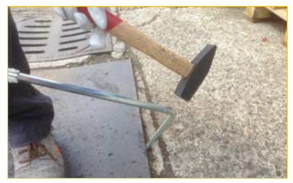
Due to its characteristics and function, it is the ideal alternative to using the classic pickaxe like in the past.