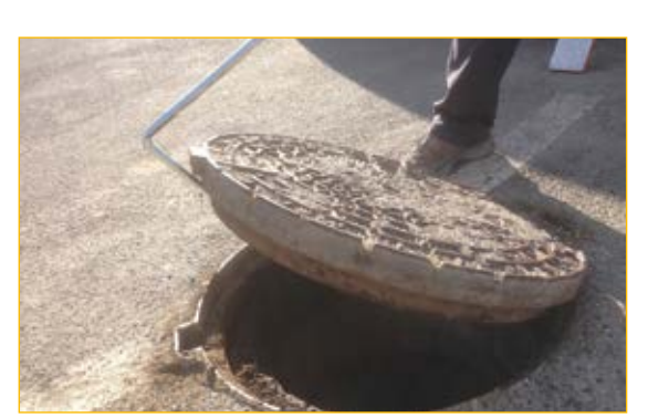
Built in tempered 38NCD4 steel with galvanized anti rust finish which makes the LB7 a resistant and robust tool.