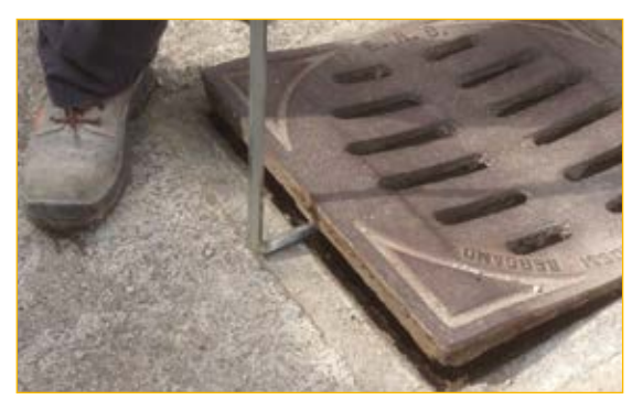
The "D" shapped handle provides a fulcrum point to facilitate the lifting operation.