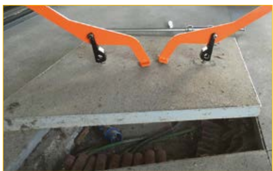
Opening larger lid can be done with two LB2.