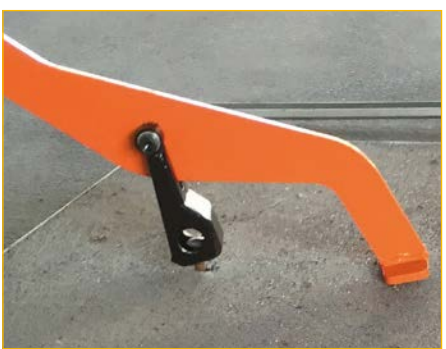
Possibility to custom hooks according to specifications if needed.