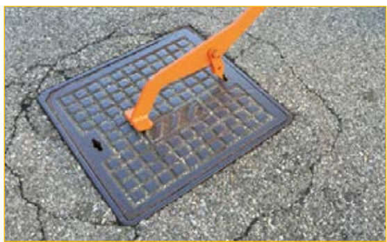
Inserting the hook into the slot and rotate to 90°.

Practical lever lifter for lids with latches or in the absence of cast iron surface. For the correct connection the lower hook is inserted into the slots on the cover and the lever is turned through 90°.