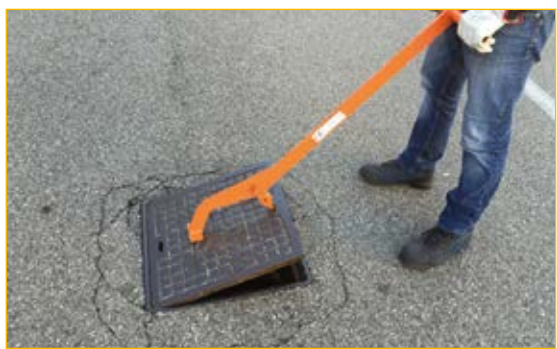
In the opening operation, the length of the lever limits the operator effort.