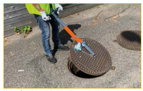
Use 3: Opening with horizontally extended handle bar.