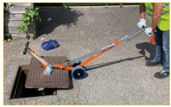
Use 2: opening with wheeled lever APS90 or APS80.