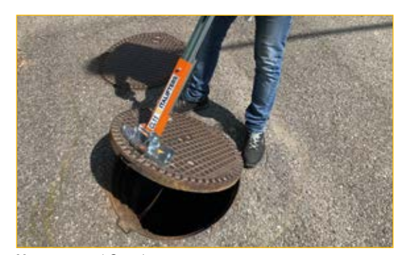
Use 1: manual Opening.

Universal magnetic lifter with curved base to ensure the best magnetic adhesion on the circumference of circular manhole covers also with "filling" cast iron frame and in asphalt / stone / cement with central metal disc.