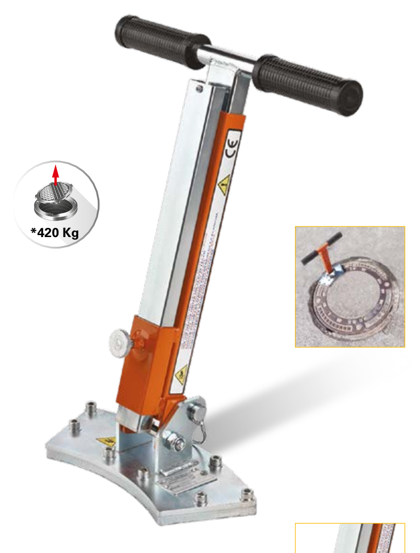
the right lift geometry and ensure the full strength of lift and turning of hinged lids.