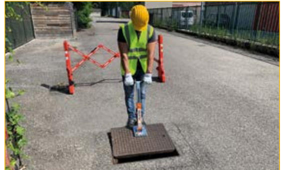
Use 1: manual Opening.