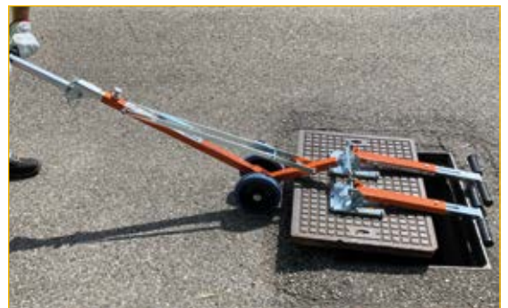
Use 3: opening with two plates in parallel position.