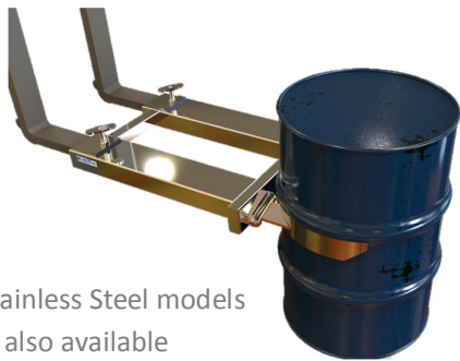
Stainless Steel models also available

Our best selling drum handler has a fully automatic action. The attachment has two curved arms which hinge at one end. To lift a drum, approach it with the clamp arms horizontal and positioned halfway up the drum, between two rolling hoops. When the arms contact the drum they will open automatically, falling back around the drum as you proceed forwards. When the attachment is raised the arms will grip the drum tightly under the upper rolling hoop.