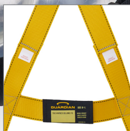
Dual Impact Indicators