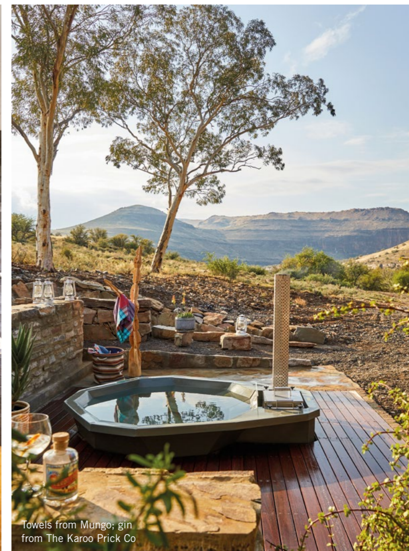
Towels from Mungo; gin from The Karoo Prick Co

About two-thirds of a former storeroom was used to create the main en suite (above left). The old cottage had ochre cement floors in the bedrooms and the couple wanted to stay true to its character, so they asked Wijnand to match these in all the new bathrooms. He used PowaFix Cement Oxide in Yellow. "In this bathroom, we ended up with a slightly richer colour, which works well in the space," says Caren.