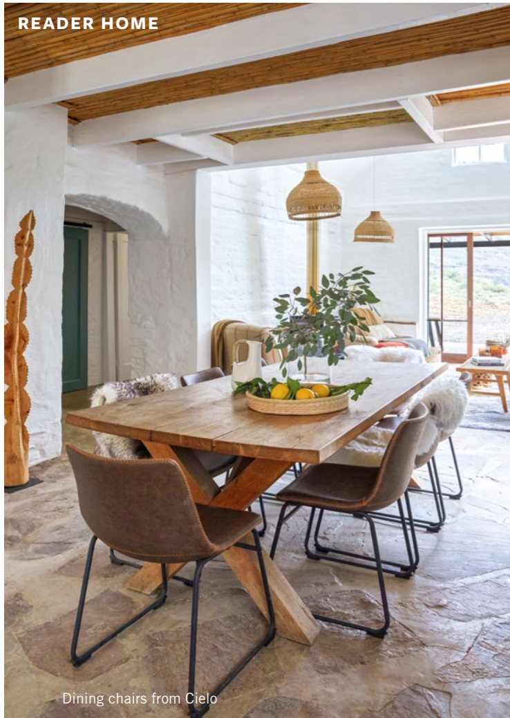
Dining chairs from Cielo