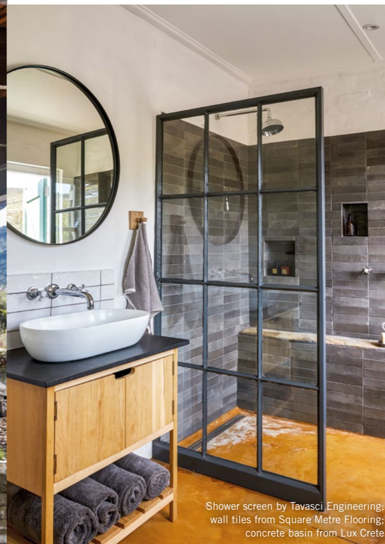
Shower screen by Tavasci Engineering; wall tiles from Square Metre Flooring; concrete basin from Lux Crete