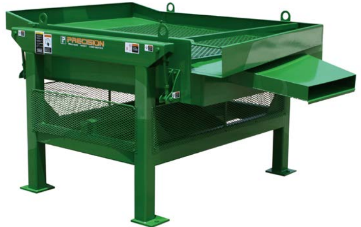
Standard Chip Screen

Each chip screens are made from heavy-duty steel with assured long-life performance. Many options and configurations are available.