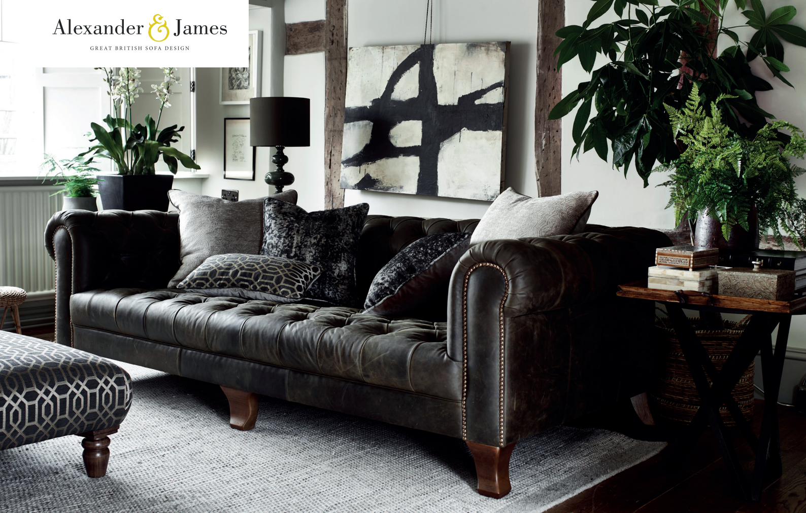
VIVIENNE MAXI SOFA SHOWN IN JIN BLACK LEATHER WITH FABRIC OPTION 1 AND DARK WOOD FEET