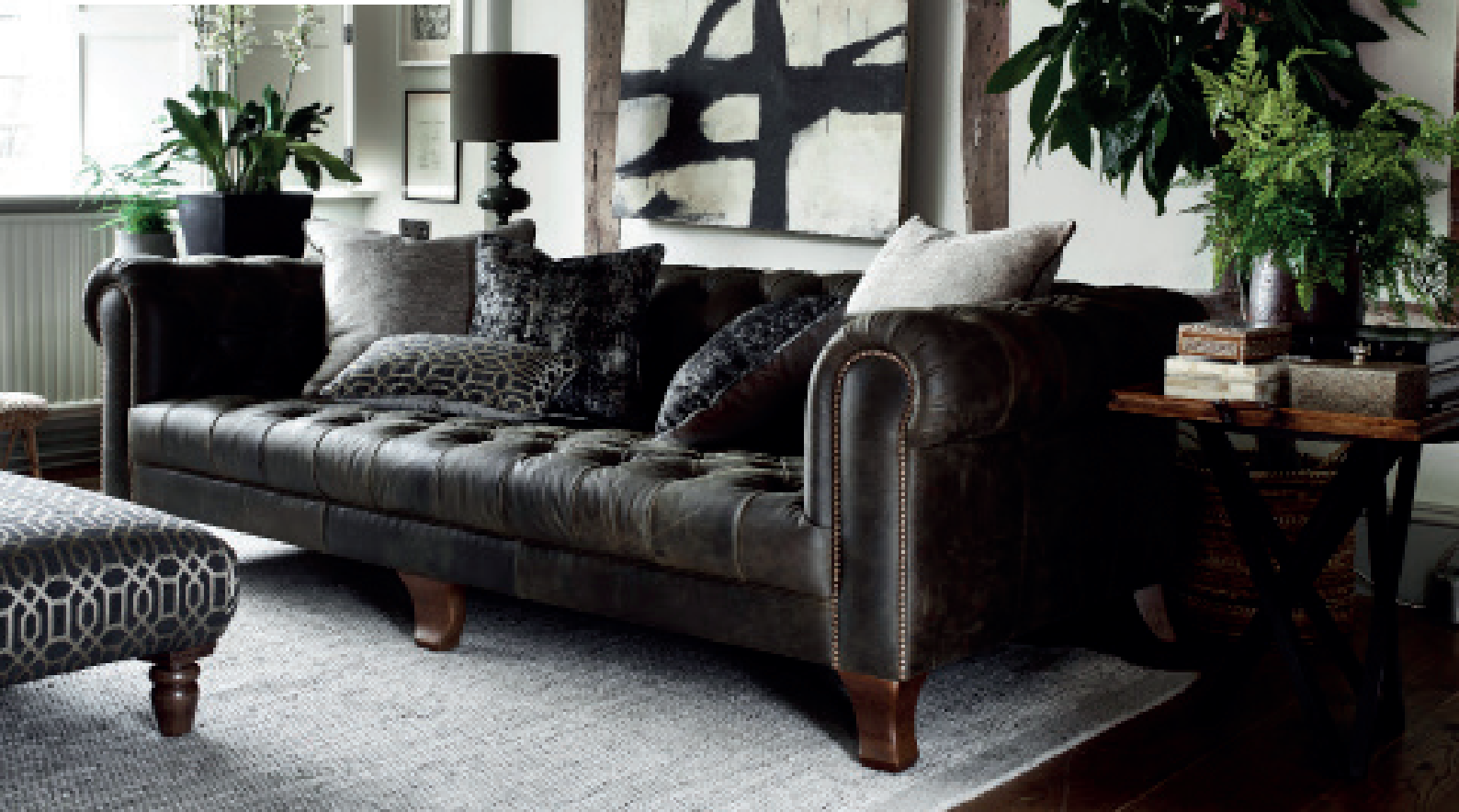
VIVIENNE MAXI SOFA SHOWN IN JIN BLACK LEATHER WITH FABRIC OPTION 1 AND DARK WOOD FEET