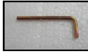
Allen Key 1 pc