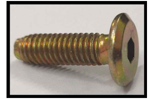
Bolt 20mm 16 pcs (20 pcs bolt for 6 drawer chest)