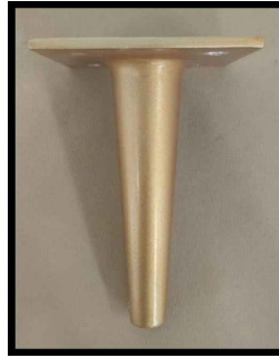
Legs 4 pcs (5 pcs legs for 6 drawer chest)