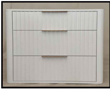
Drawer Chest 1 pc