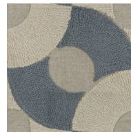
6421-31 Gr 9

Add 3/8" Nailhead Trim added around the base (upcharge)