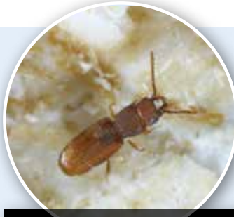
FLAT GRAIN BEETLE ( CRYPTOLESTES SPP.)