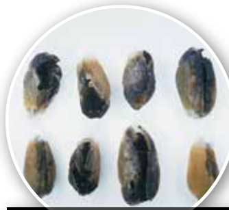
KARNAL BUNT ( TILLETIA INDICA )

The following pests have a high potential impact on the value of stored grain if they were to establish in Australia. Report any unusual sightings immediately to the local State department of agriculture or ring the Exotic Plant Pest Hotline on 1800 084 881.