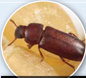
RUST-RED FLOUR BEETLE ( TRIBOLIUM CASTANEUM )