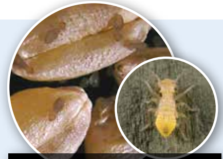
PSOCIDS ( LIPOSCELIS SPP), BOOKLICE