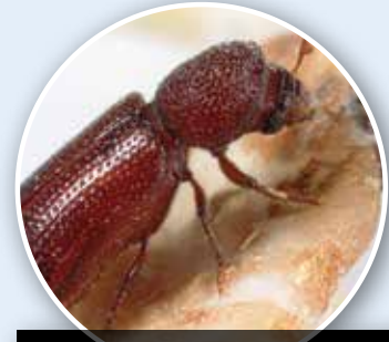
LESSER GRAIN BORER ( RHYZOPERTHA DOMINICA )