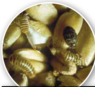
KHAPRA BEETLE ( TROGODERMA GRANARIUM )