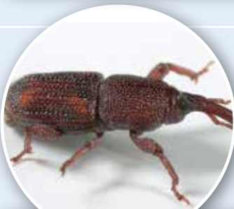
RICE WEEVIL ( SITOPHILUS ORYZAE )